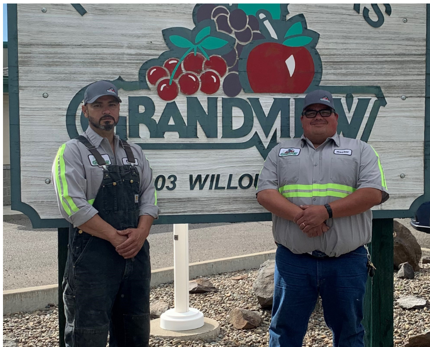
City of Grandview Water Plant Operators

In 2023 the Public Works Department collected a total of 233 water samples and monitored for over 100 contaminants. When contaminants are detected they are typically below the levels that EPA has established.